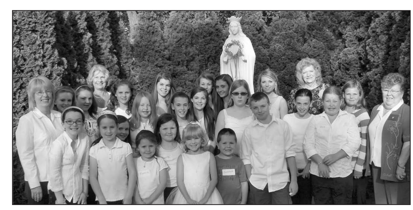
The Annual May Crowning of Our Lady of Knock and 'Spaghetti Dinner' hosted by the Div 7 Junior Boys and Junior Girls, benefitting the Make-A-Wish Foundation was held on Fri May 7, 2010.

FIRST CLASS PRE-SORTED U.S. POSTAGE PAID Permit #190 Smithtown, NY